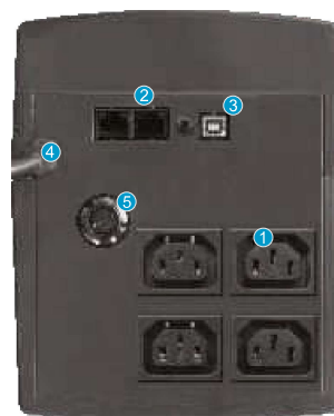
1200VA ~ 1500VA