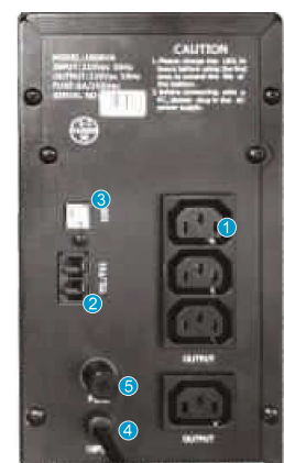
1500VA ~ 2000VA