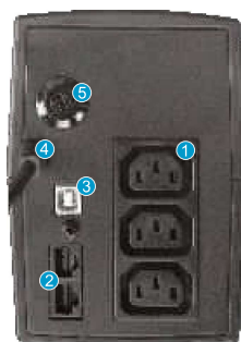
400VA ~ 800VA